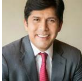
Hon. Kevin de León California Senate President pro Tem

Gain insights from leading carbon market and climate policy experts at NACW 2018: