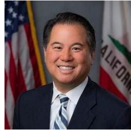
Hon. Phil Ting Assemblymember, State of California